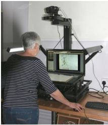
iCam archival camera in use

Our considerable photographic archive has been painstakingly built up over the years. Despite having all this wonderful material, we realised that it was all vulnerable to deterioration, and not particularly easy to use.